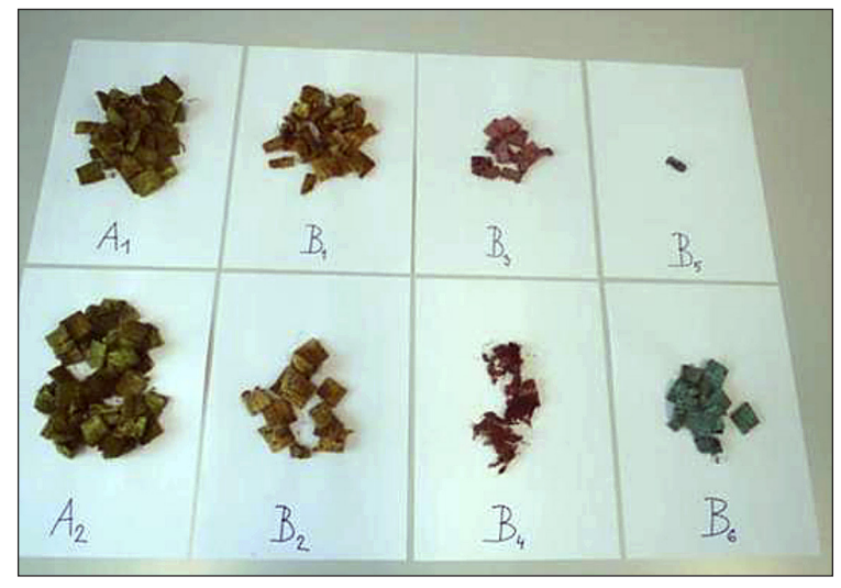
Figure 6. The sponge pieces after composting process

ed according to Kalina [Kalina, 2004]. The humidity was measured by a preliminary test periodically during the entire course of the experiment.