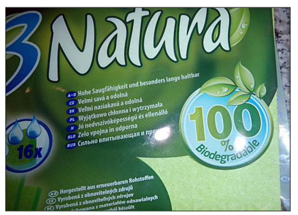
Figure 1. Biodegradable sponge cloth – samples A (A_1, A_2)

The amounts of synthetic waste and sponge pieces placed in each reactor are listed in Table 1.