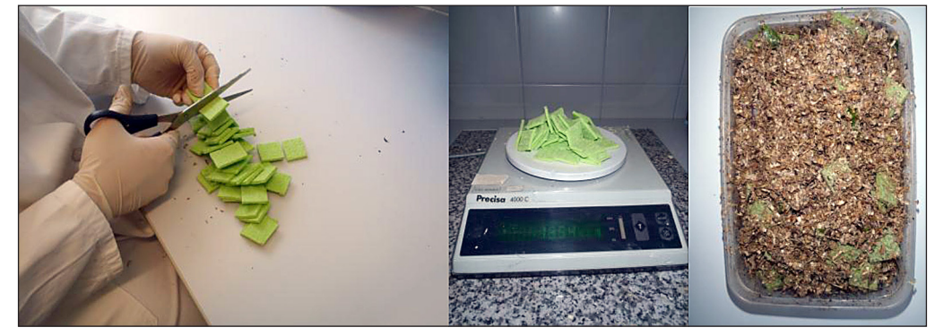
Figure 3. Sponge pieces cut into smaller ones

* M_i - initial dry mass of sponge pieces.