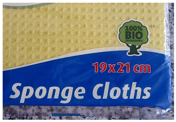
Figure 2. Biodegradable sponge cloth – samples B